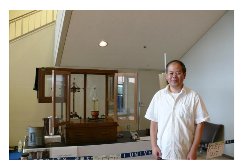
Honda's thermobalance and me